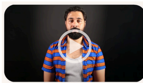
Aboriginal People Respond to "Australia Day"

That's what reconciliation is – recognising and healing the past so that we can build a better and more unified tomorrow. Talk with your local First Nations' peoples to inform yourself on their views of the date.