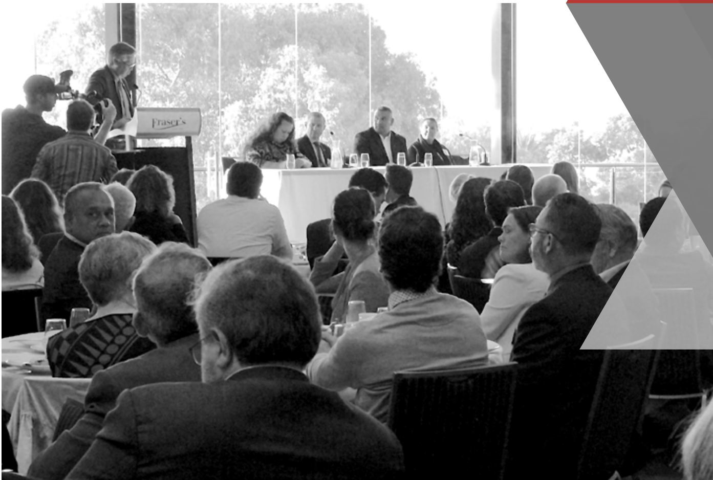
250 Attendees at the 2017 Reconciliation Breakfast.

In line with the NRW message of “Let’s Take the Next Steps Together”, RWA hosted high-profile event targeting leaders from all walks of the Western Australian community. The 250 attendees were challenged to engage more deeply in the reconciliation movement and to champion this through their respective communities. The breakfast consisted of inspiring and insightful speeches and a panel discussion from prominent authorities who contribute significant leadership and passion to state and national matters of reconciliation importance.