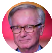
Fred Chaney AO